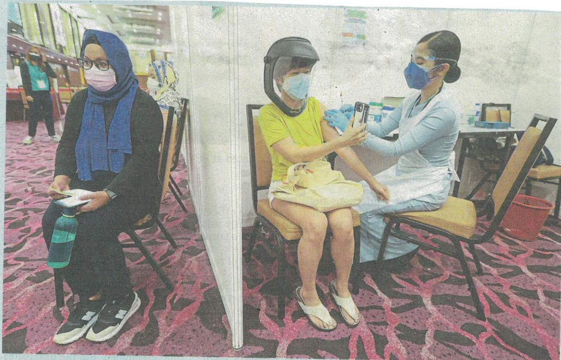
Not taking chances: A woman donning a special face shield as she receives her second dose of Covid-19 vaccine at Ideal Convention Centre in Shah Alam.

On the daily vaccination rate, a total of 447,035 doses were administered on Friday with 187,756 of them as first dose and 259,279 for second dose recipients. — Bernama