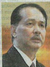
DR NOOR HISHAM

Memperincikan tentang kes kematian, Dr Noor Hisham berkata, ia melibatkan 88 kes di Selangor, Kuala Lumpur (33), Johor (28), Kedah (17), Sabah (13), Melaka (lapan), Perak (enam), Negeri Sembilan dan Kelantan (lima), Pulau Pinang (empat) serta masing-masing