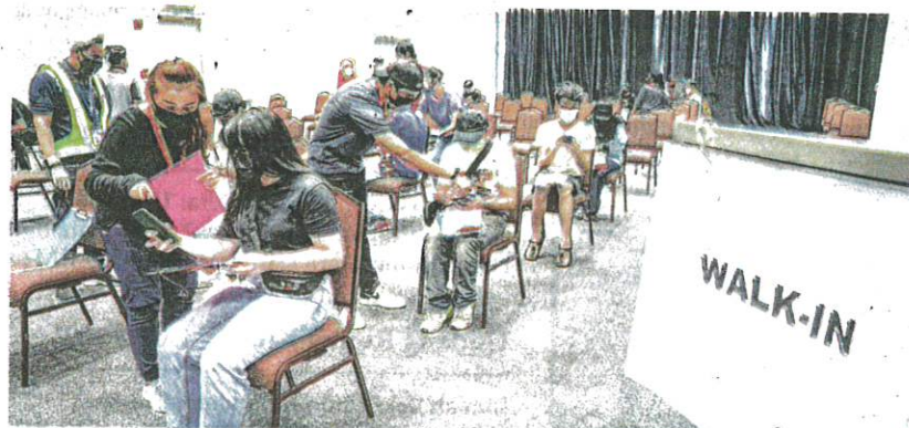
SEBAHAGIAN penerima vaksin berusia 18 tahun yang hadir secara "Walk In" di Pusat Pemberian Vaksin Pusat Konvensyen Kuala Lumpur semalam.

“Lapan negeri merekodkan kes tiga angka iaitu Pulau Pinang (959), Kelantan (930), Negeri Sembilan (884), Perak (774), Pahang (714), Sarawak